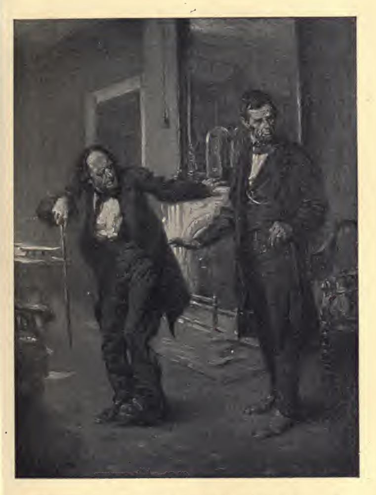
"The South is conquered soil. I mean to blot it from the map."